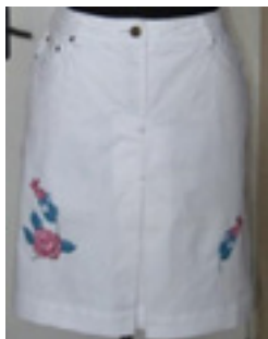
Fig. 2. Models of waist clothes with embroidery in ethnic style

As a result of the analysis of the creativity of the leading world and Ukrainian designers of clothes it is revealed that the use of ethnic heritage is relevant in creating collections of modern clothing. The authors of the article developed models of waist products made of cotton fabric, decorated with stylized embroidery motifs “rose” (Fig. 2). The figure shows the elements inherent in Ukrainian embroidery: flowers, buds, leaves and stems. Embroidery is performed on an embroidery semiautomatic device using the technology described in [5]. Embroidery design is obtained from open sources on the Internet.