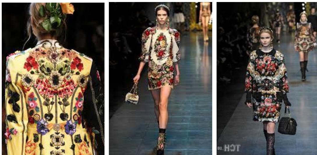
Figure 2. Dolce & Gabbana 2013 collection [4]

In recent years, vyshyvanka has become one of the trendiest wardrobe items and another brand. Couturier Moncler Gamme Rouge, Sportmax brand designer Giambattista Valli, Prabal Gurung, Gucci and others have influenced it. Moncler Gamme Rouge released a collection with white dresses decorated with a red pattern, as well as a knitted outfit with a Vedic red geometric pattern (Fig. 3).