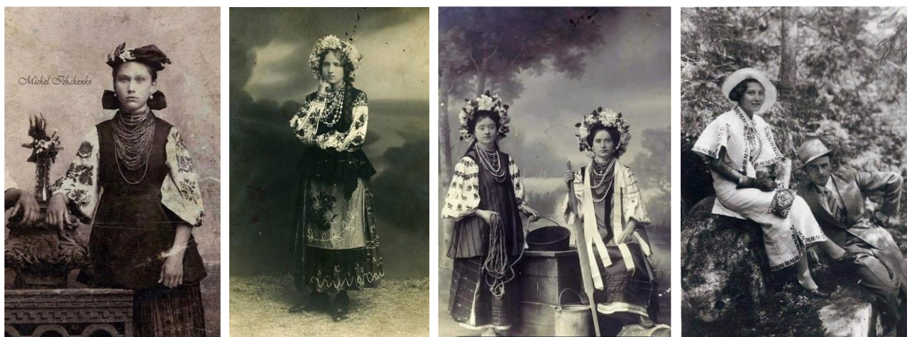
Figure 1. Archive photos. Embroidered clothes of Ukrainian women

Ornament is a system of signs, a language without words, which contains many secrets and deep wisdom. According to A. Kulchytska: "An ornament is a symphonic polyphony, it embodies the charms of folk fantasy, depicts the beauty of the earth, nature, the sun, animals and man. The Ukrainian woman managed to preserve and pass on to her descendants the masterpieces of Ukrainian embroidery and thereby enrich the culture of her people. The patterns on the jugs of the Trypil culture are breathtaking: trees, branches, leaves, flowers, seeds-grains, animals and human figures with their hands raised above their heads, like a "bereginya". Surprisingly, the same motifs can be found in traditional embroidery and woven towels in our time. The main creator of ornament - embroidery is a woman, and a Ukrainian woman too (fig. 1), who invested in embroidery, as in a song, her own worldview, all her grief and happiness" [2].