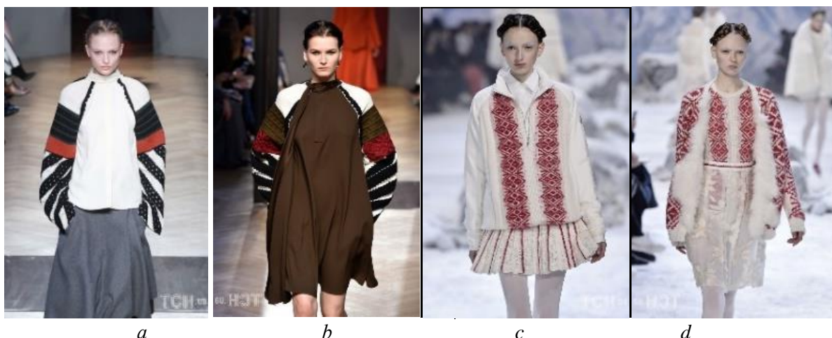
Figure 3, a - d. a, b - designer of the Sportmax brand Giambattista Valli, 2016 collection; c, d - Moncler Gamme Rouge collection of 2016 [5, 6]

In recent years, vyshyvanka has become one of the trendiest wardrobe items and another brand. Couturier Moncler Gamme Rouge, Sportmax brand designer Giambattista Valli, Prabal Gurung, Gucci and others have influenced it. Moncler Gamme Rouge released a collection with white dresses decorated with a red pattern, as well as a knitted outfit with a Vedic red geometric pattern (Fig. 3).