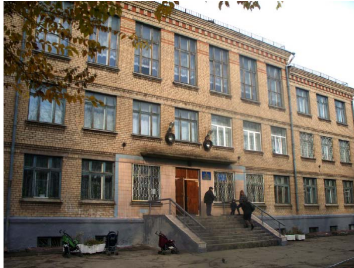
Fig. 1. The 3-storey school building constructed in 1960

Research results. The building under study is a 3-storey school building , located in Kyiv (Ukraine) and built in 1960. The projected building footprint is 1453 m 2 (Fig. 1). The heated area is 3780 m 2 , and the heated volume is 13130 m 3 .