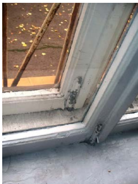
Fig. 2. The low energy windows of the school building

The external walls of the building consist of interior plaster (20 mm) and brickwork (510 mm) with their corresponding U-value of 1,15 W/(m 2 K). The top floor ceiling is composed by a concrete slab (220 mm) as well as a bed of gravel and its relative U-value is 0,544 W/m 2 K. The floor on grade consists of such components: linoleum, sand-cement screed (40 mm), concrete slab (300 mm). The corresponding U-value of it is 2,02 W/(m 2 K). The windows have double glazing in timber frames (Fig. 2). The U-value of the existing windows is 2,78 W/(m 2 K). The building includes 7 exterior doors. The U-value of the doors is 2,65 W/(m 2 K). The ventilation type of the school building foresees only window ventilation.